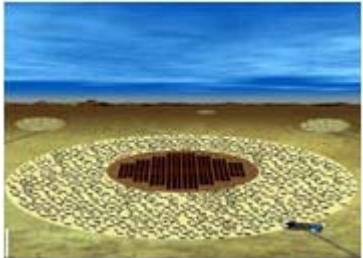
Download hi-res JPG - size 464 KB

An artist's impressions of part of the core of the SKA. Tile-shaped antennas making up the central focal plane array is surrounded by dish-shaped antennas. The SKA will consist of thousands of antennas, spread over 3 000 kilometres. About half of the antennas will be in a central region about 5 kilometres across.