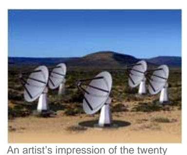
dishes of the Karoo Array Telescope on site near Carnarvon in the Northern Cape. Each of the 20 dishes will be 15 m in diameter and about 19 m high.