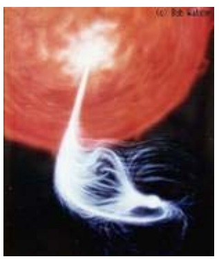
Figure 1. The artist Bob Watson's painting of 'Polar' binary.

Imagine now that you are looking at a binary system like this from "behind" the cool, red star with your viewing angle such that the red star, once an orbit, passes in front of the white dwarf and cuts off your view of it. If you had a telescope like SALT, and a camera on it like SALTICAM, which can make brightness measurements every 100 milliseconds, you would see the brightness of the system dim quite drastically because the light from the gas crashing on to the magnetic poles of the white dwarf completely outshines the light from everything else.