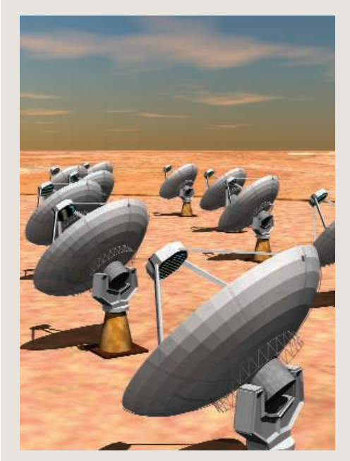
Aussie array. Artist's drawing shows part of the array of dishes planned for Australia's Extended New Technology Demonstrator (xNTD).

Australia's Extended New Technology Demonstrator (xNTD) is planned as a full-system prototype, making use of an innovative phased focal-plane array, a detector made of a patchwork of antenna elements that can steer its field of view electronically. The demonstrator, operating over the frequency range of 0.8 to 1.8 gigahertz, will be built at the Mileura site, with completion targeted for 2009. Others are in the works too: the SKA Molonglo Prototype from the University of