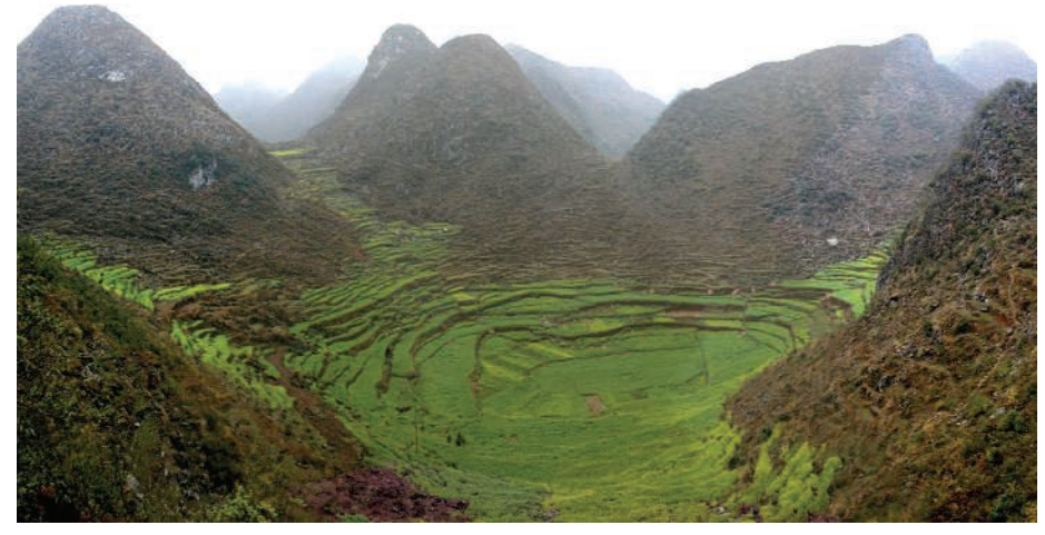
What a dish. China's proposed SKA site lies in a lush valley surrounded by karst hills. Proponents say natural depressions there are ideal for building fixed dish antennas.

With a price tag likely to be at least $1 billion, the SKA collaboration is treading carefully. The project has already been working for more than a decade; a reference design for the telescope was completed only this year, and the array itself is unlikely to be finished before 2020. But the team doesn't want to force the pace and fall into the traps that have beset other recent international collaborations